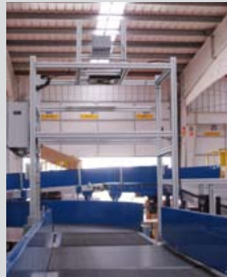
Volume measurement system VIPAC D1 can also be installed by the users themselves.